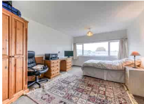
Radnor Close, Mitcham, Surrey, CR4 1XU