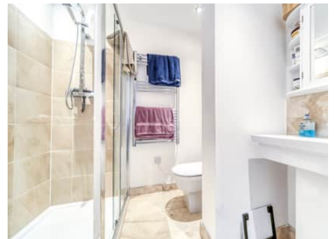
Newton House, Queens Road, Croydon, Surrey, CR0 £220,000 Leasehold