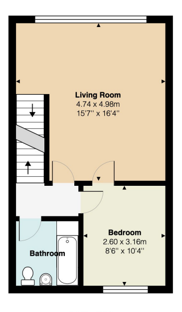
First Floor Area: 39.3 m² ... 423 ft²