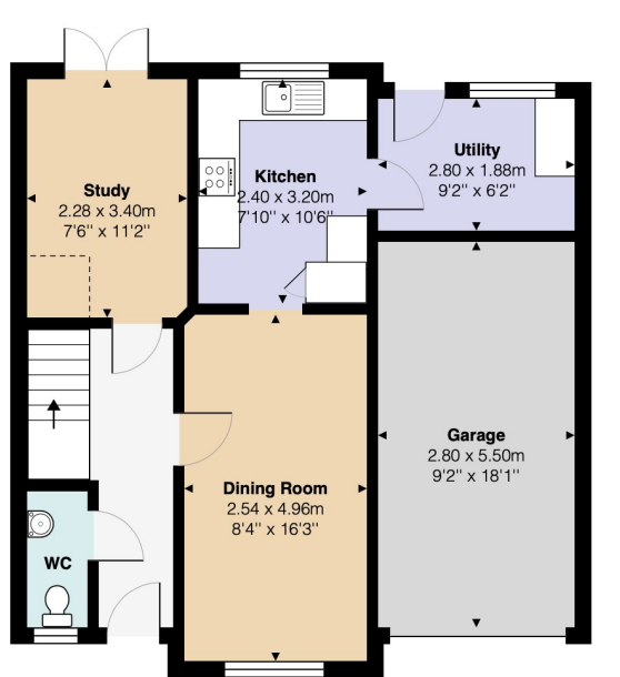
Ground Floor Area: 61.4 m<sup>2</sup> ... 661 ft<sup>2</sup>