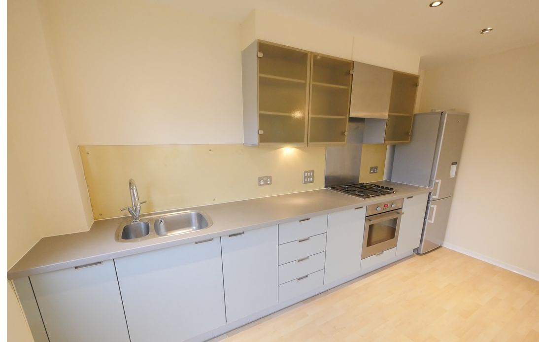
Flat 59 Vermillion Court, Elvedon Road, Feltham, Greater London TW13 4SQ £249,950 - Leasehold