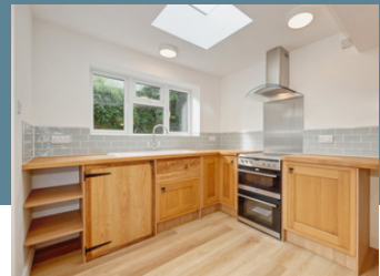
2 Candle Cottages, Stoney Lane, Hailsham, East Sussex BN27