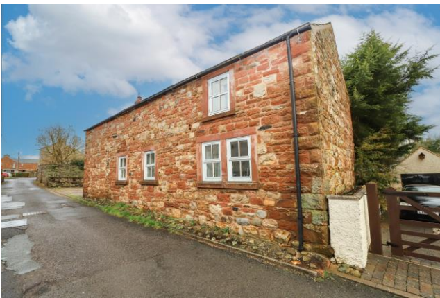
EXTERNAL FROM ROADSIDE