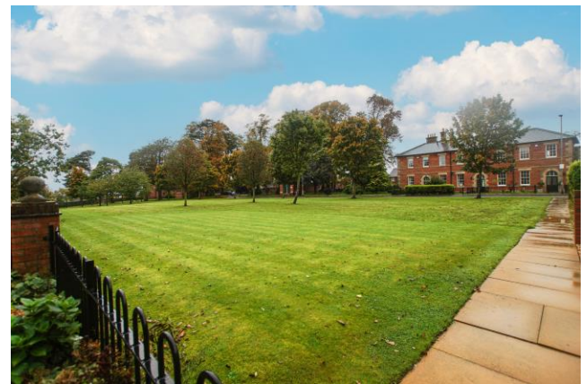
OUTLOOK OVER THE GREEN

TENURE We are informed the tenure is Freehold. Service charge £53 pcm including building insurance, annual boiler service, window cleaning and external painting.