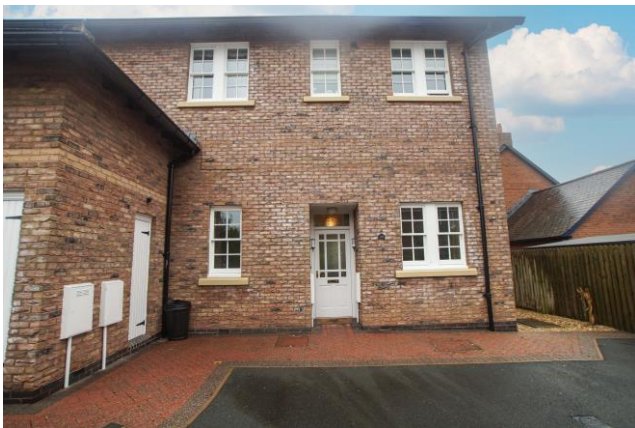
REAR OF THE PROPERTY

OUTSIDE Two allocated parking spaces and outbuilding to the front of the property with shelving and light. To the rear of the property is a paved patio with gravelled areas, floral borders and views over Parkland Village green. The property also has use of a communal garden area.