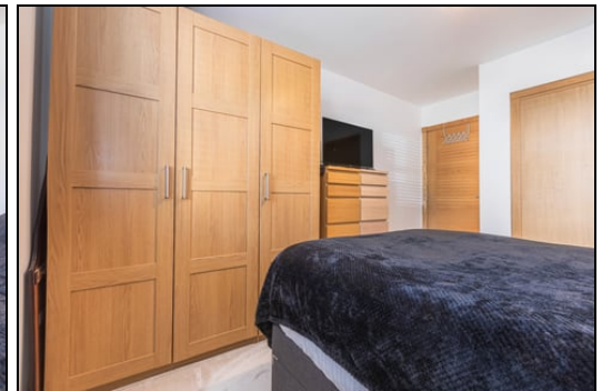
3.1m x 4.3m (10' 2" x 14' 1")