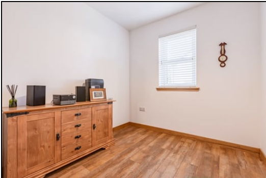
3.6m x 2.3m (11' 10" x 7' 7")