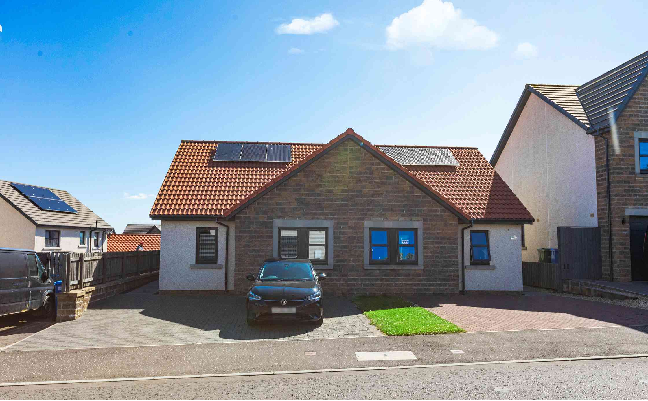
Offers in Region of £170,000 54 Joe Temperley Wynd, Lochgelly, Fife, KY5 9AE