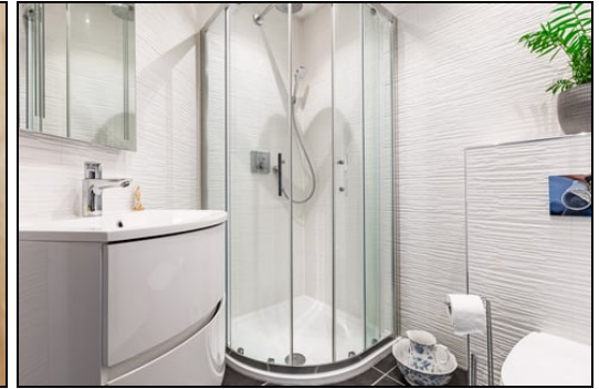
2.1m x 2.0m (6' 11" x 6' 7")