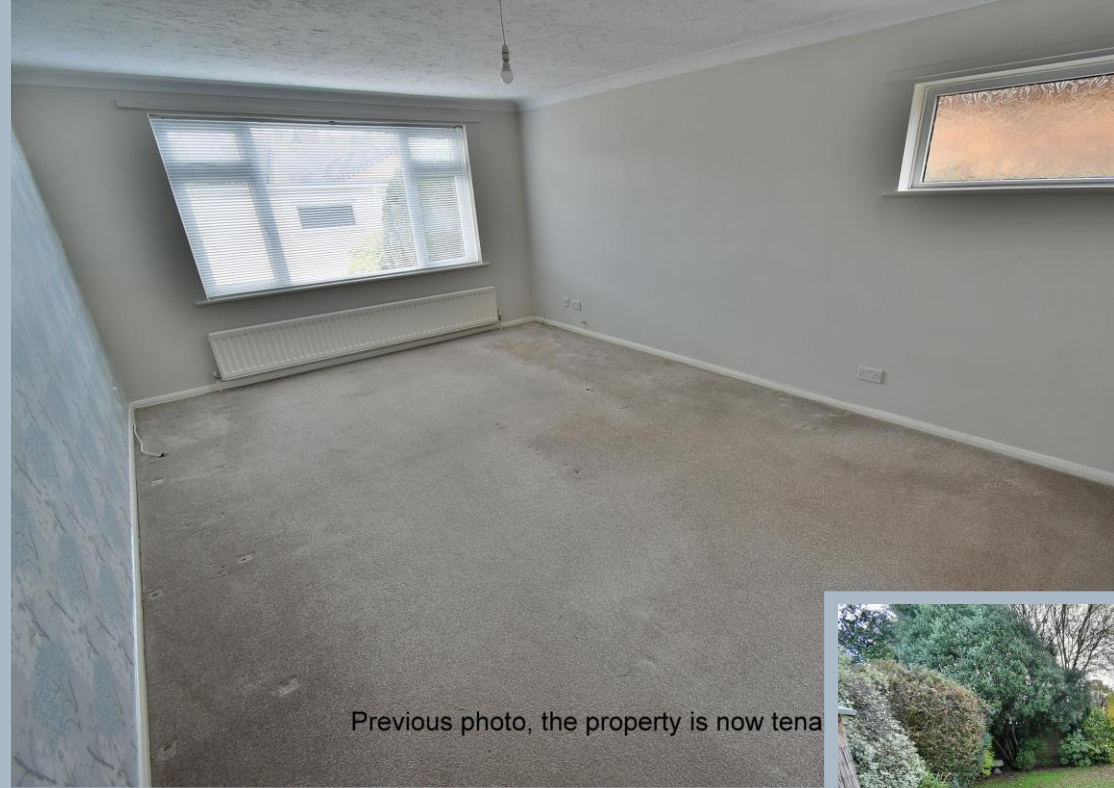
Previous photo, the property is now tenanted