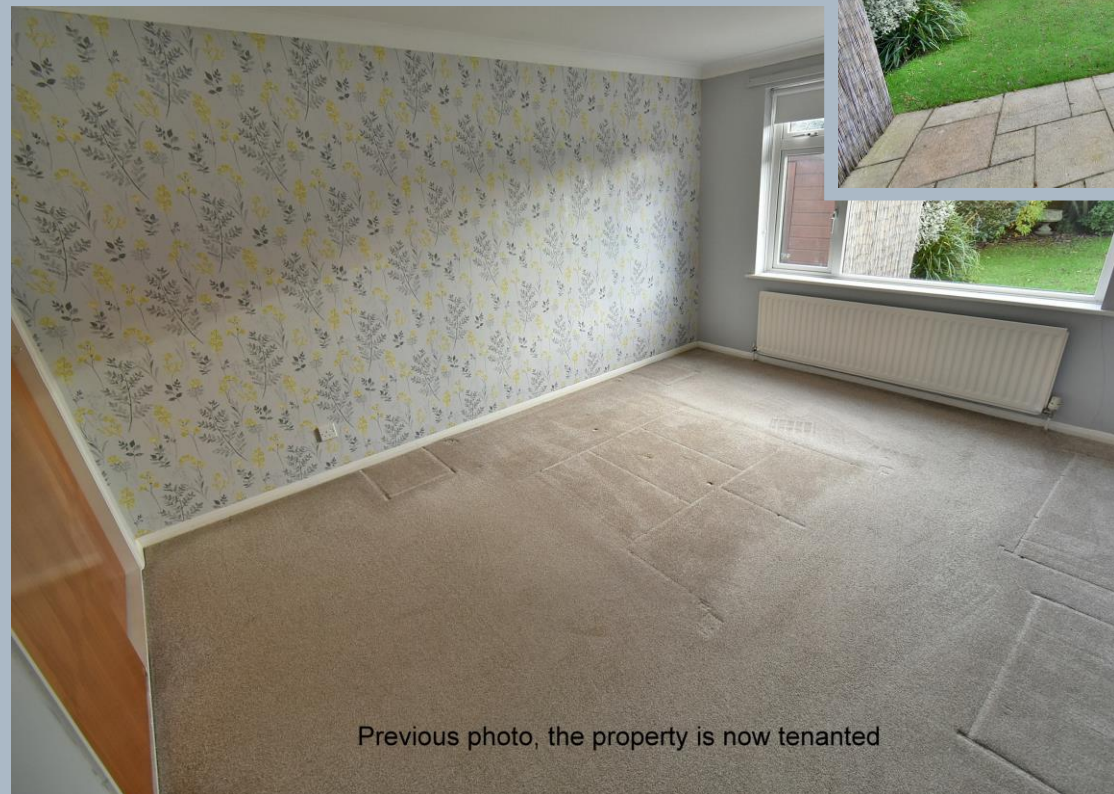
Previous photo, the property is now tenanted