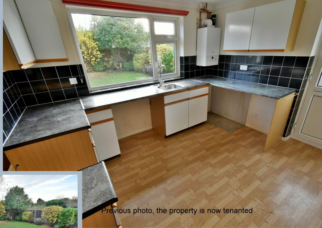
Previous photo, the property is now tenanted