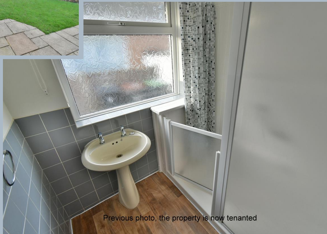
Previous photo, the property is now tenanted