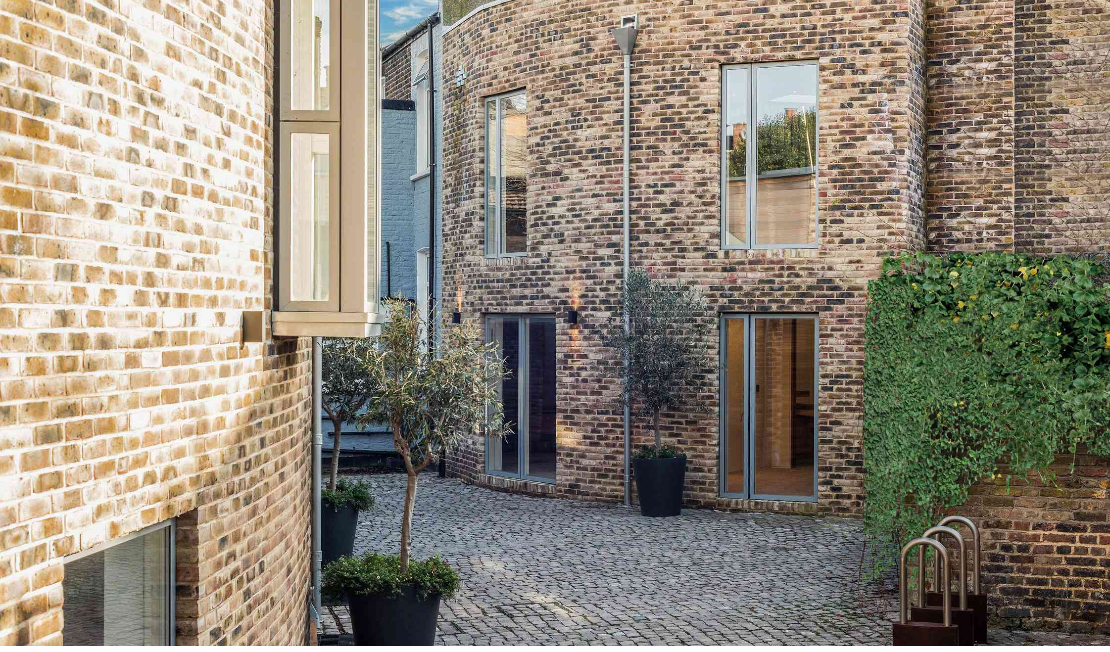
Lycett Place, London, W12 9ER