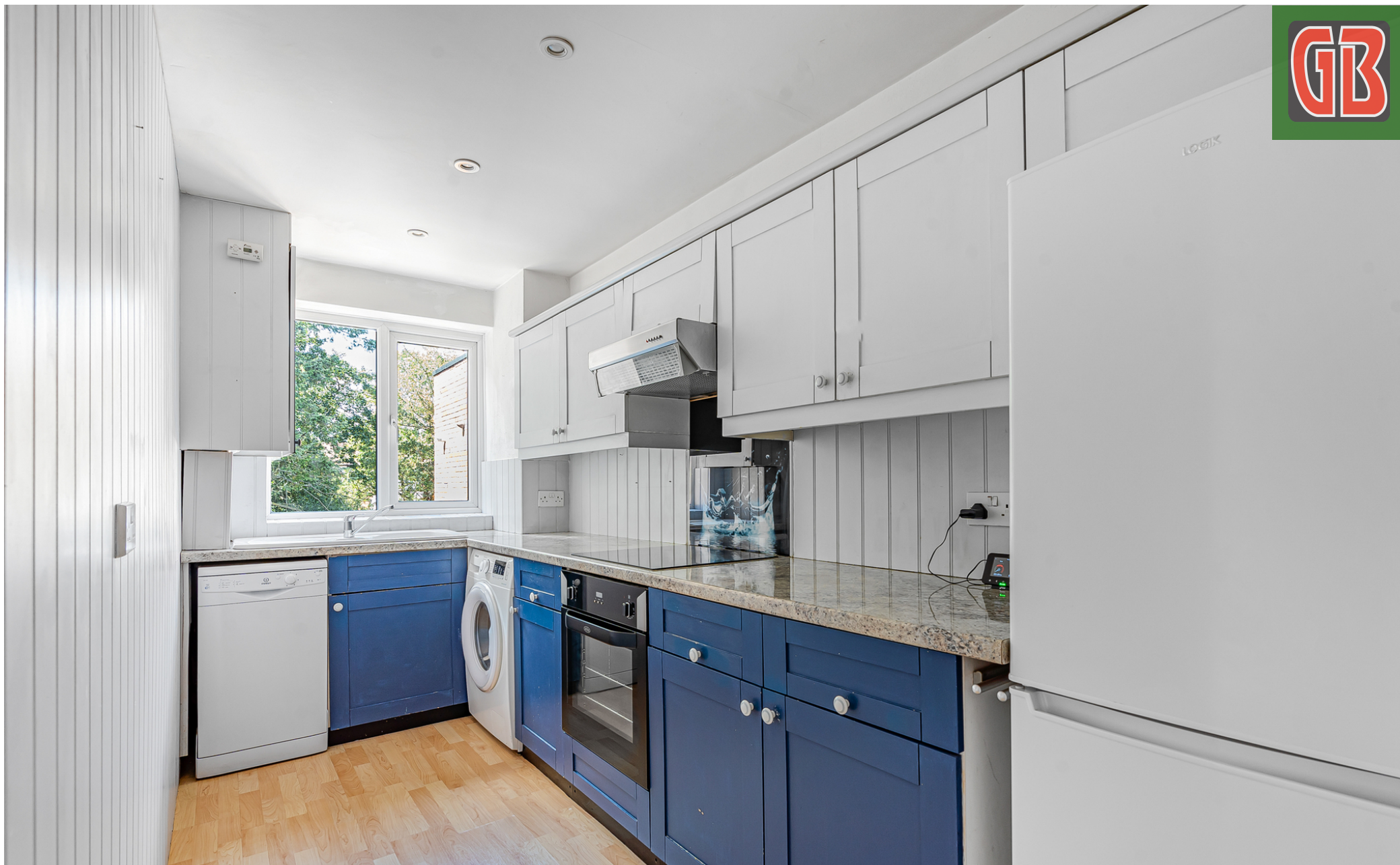
15 St Catherines Court, Rosefield Road, Staines-upon-Thames. TW18 4NH. 2 Bedroom Apartment - £300,000 Share of Freehold