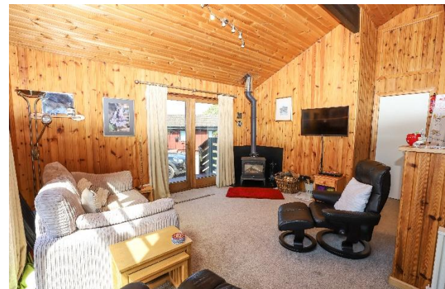
OPEN PLAN LIVING DINING KITCHEN