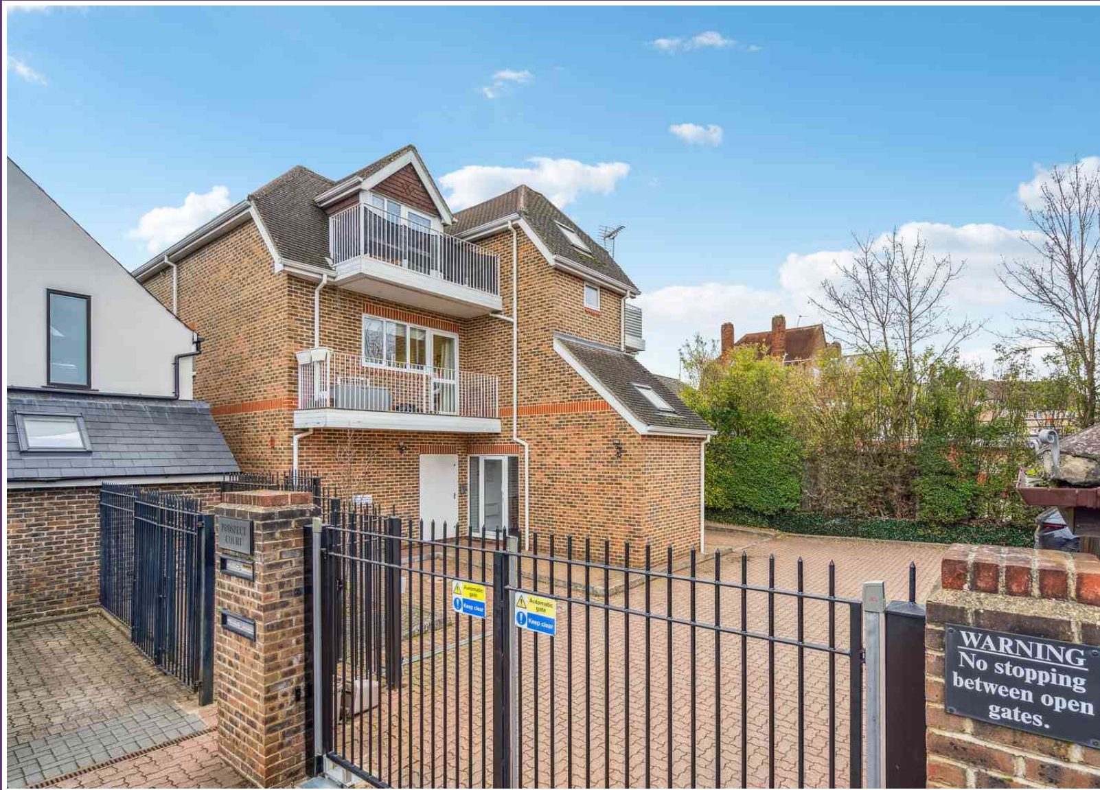
Flat 2 Prospect Court, Beaconsfield Road, Farnham Common, Buckinghamshire. SL2 3QJ £285,000 Leasehold