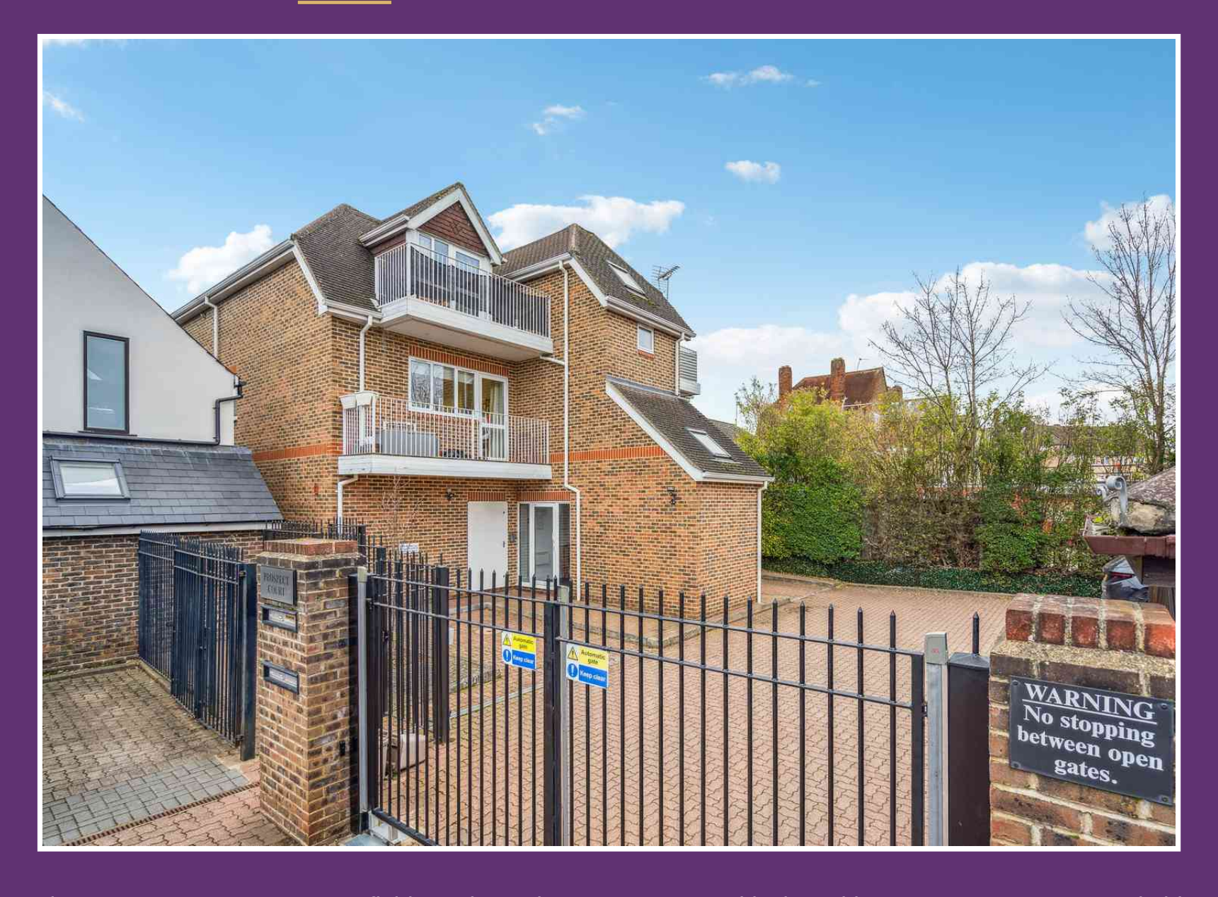
Flat 2 Prospect Court, Beaconsfield Road, Farnham Common, Buckinghamshire. SL2 3Q£285,000 Leasehold