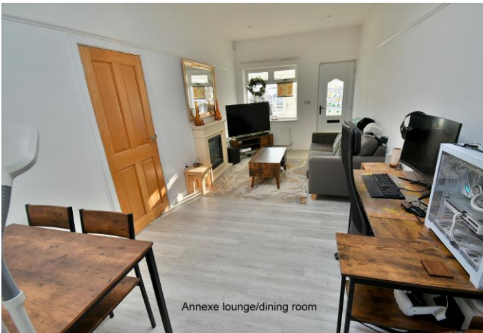
Annexe lounge/dining room