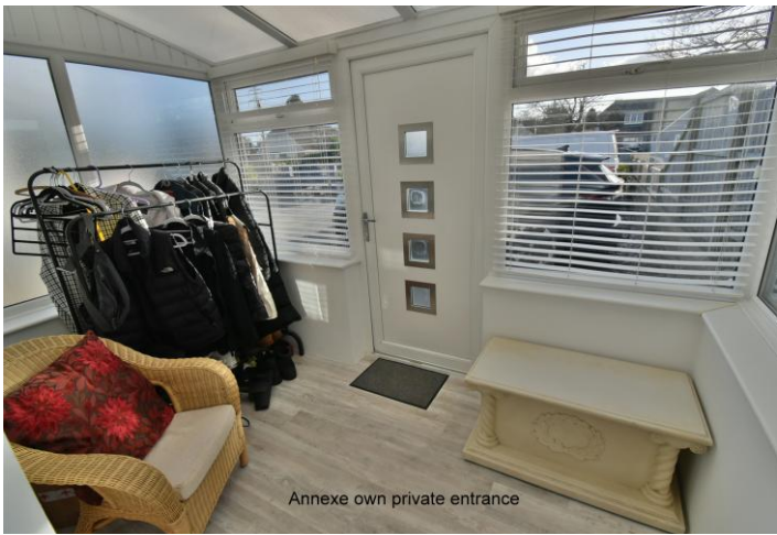
Annexe own private entrance