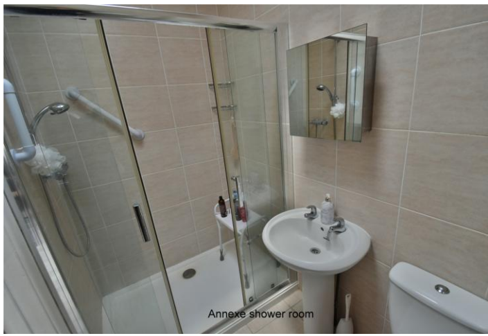
Annexe shower room