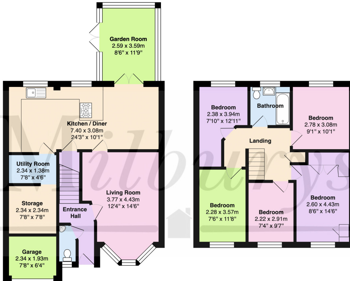
Ground Floor Area: 73.8 m 2 ... 794 ft 2