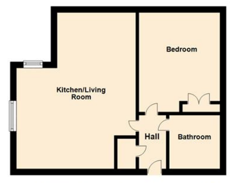
Floor plans are for layout purposes only. Measurements are approximate and subject to inaccuracies Plan produced using PlanUp.