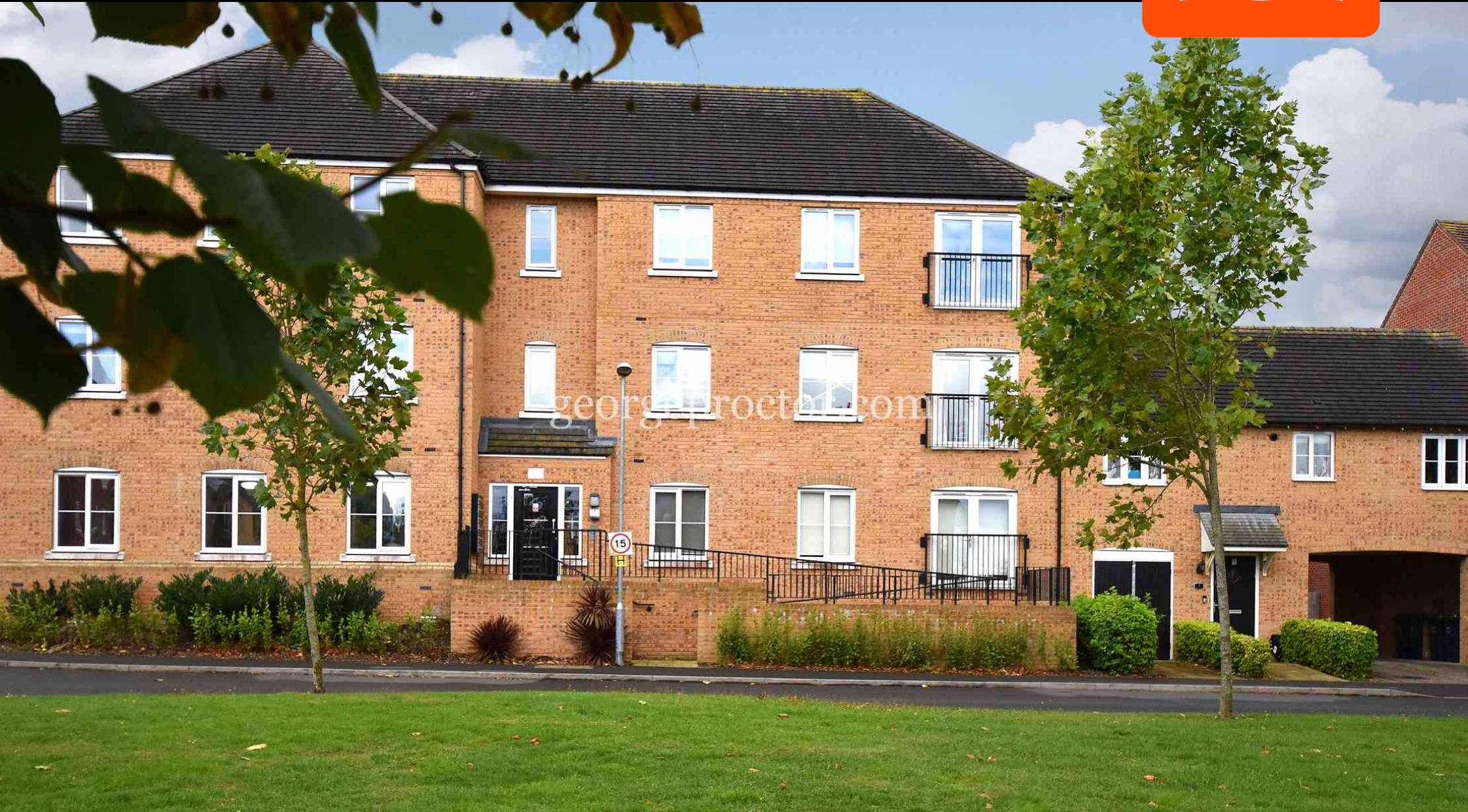
Ravens Dene, Chislehurst, Kent. BR7 5FL