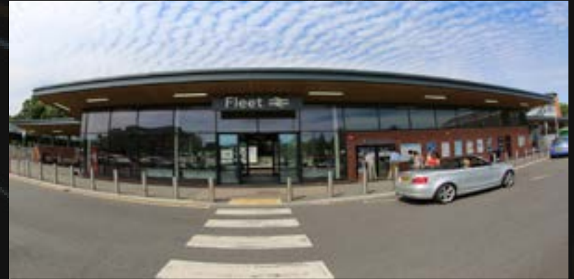
Fleet Mainline Railway Station