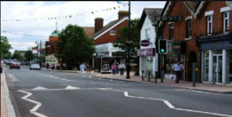
Fleet High Street