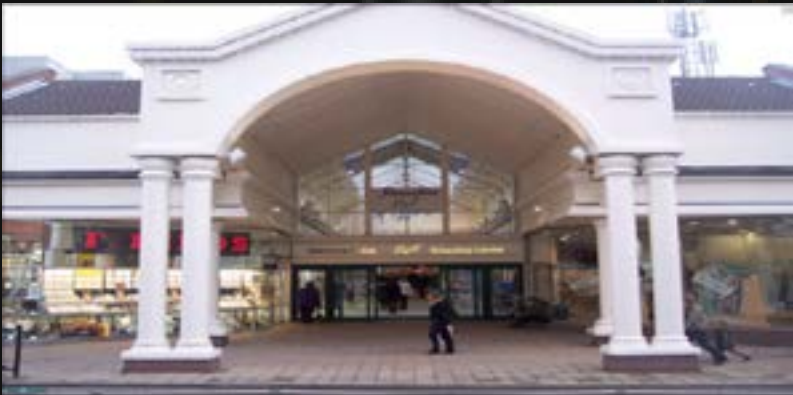
Hart Shopping Centre

The villages of Hartley Wintney and Odiham plus the attractive market town of Farnham are all within a six mile drive.