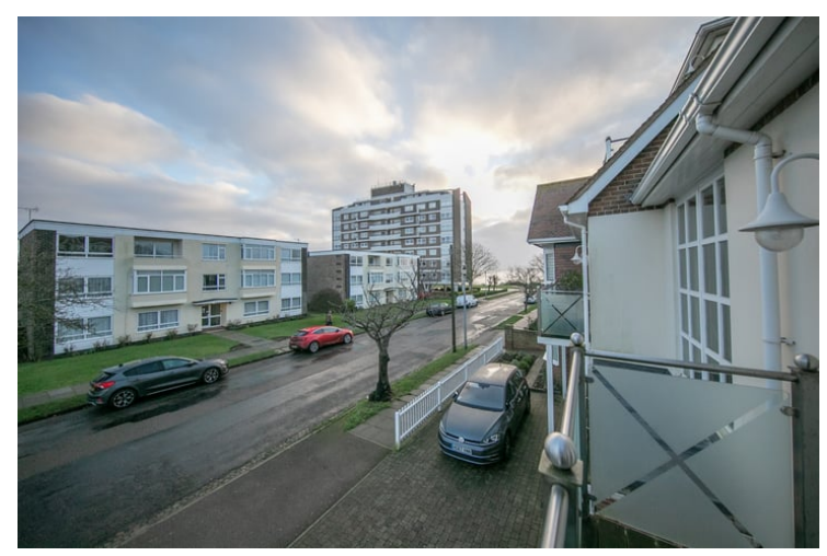
Allocated off road parking to the front via the block paved driveway and communal bin area.