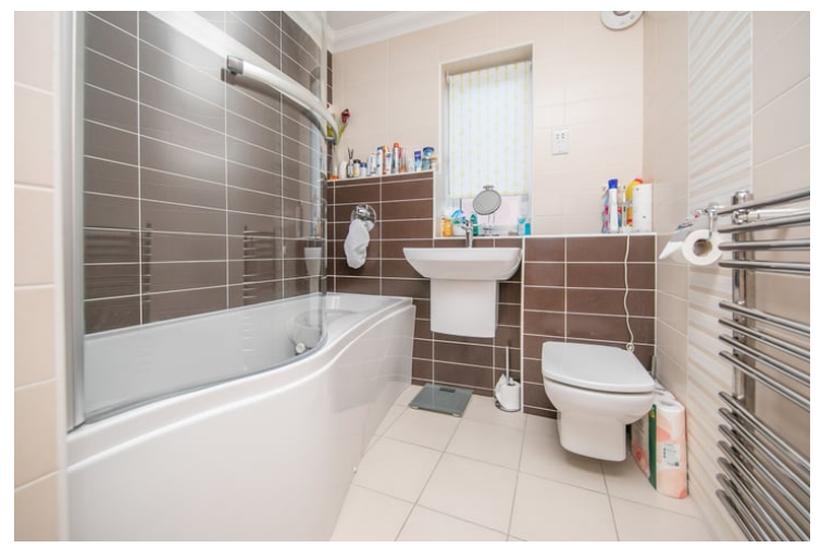
9' 8" x 6' 2" (2.95m x 1.88m) Tiled floor and walls, white suite including low level WC, wash hand basin, paneled bath with over head shower.