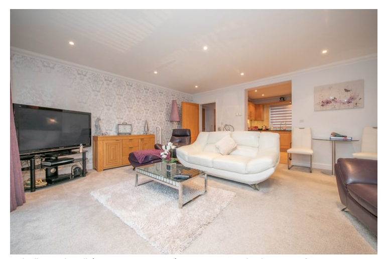
18'\,8'' \times 15'\,11'' (5.69m x 4.85m) UPVC French doors to front opening onto balcony, under floor heating, spacious living space opening onto the kitchen.