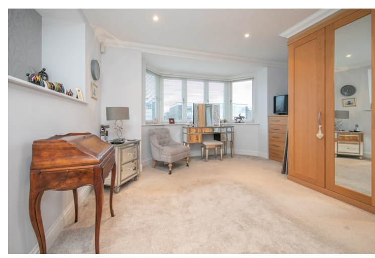
14'\,11''\,x\,12'\,0'' (4.55m x 3.66m) Double glazed bay window to front, built in wardrobes, door to en-suite.