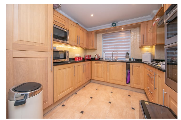
9' 1" x 8' 9" (2.77m x 2.67m) Inset spot lights, A fitted oak shaker style kitchen including a range of base and wall units, tiled splash back, stainless steel sink, granite worktops, integrated double oven, gas hob, microwave, dish washer, washing machine, fridge/freezer and extractor cooker hood.