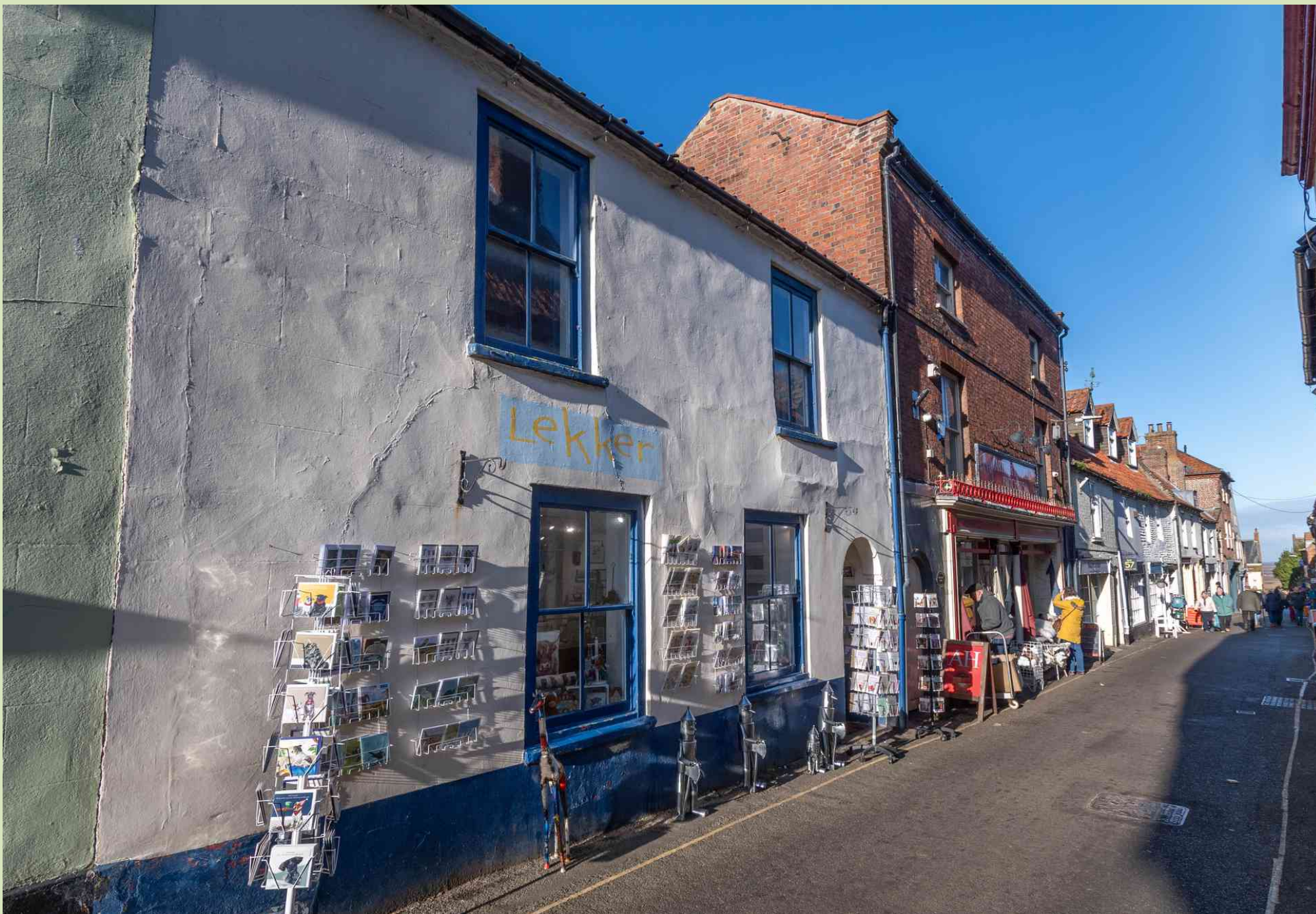
Shop and Cottage, Wells-next-the-Sea Guide Price £425,000