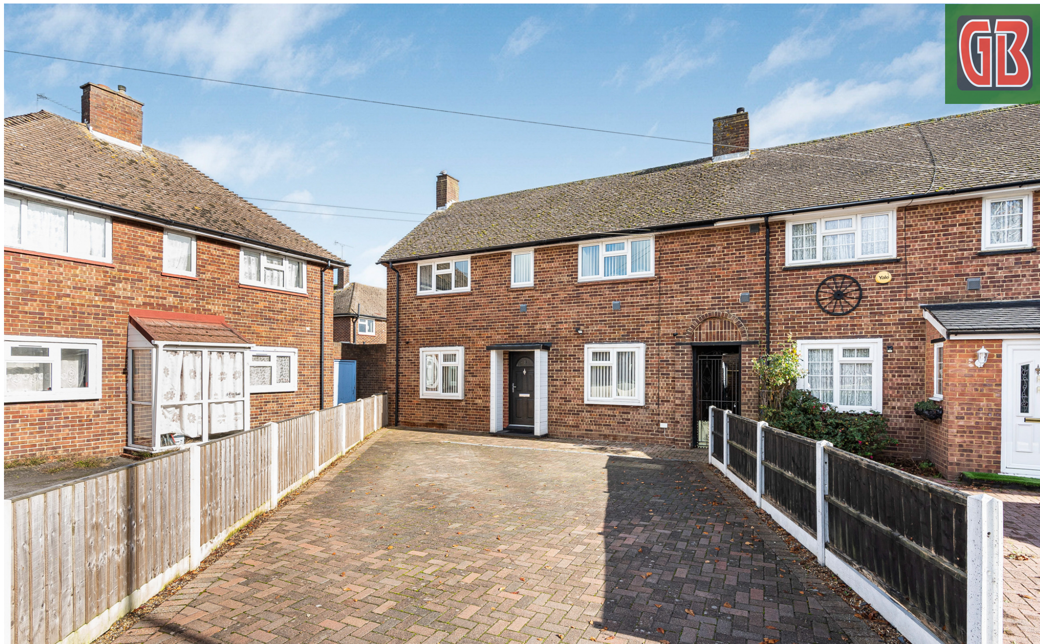
6 Clare Road, Stanwell, Staines-upon-Thames, Surrey. TW19 7QG. 3 Bedroom End of Terrace House - £500,000 OIEO Freehold