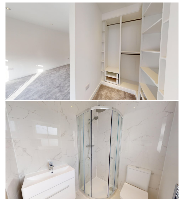
Bedroom with En Suite