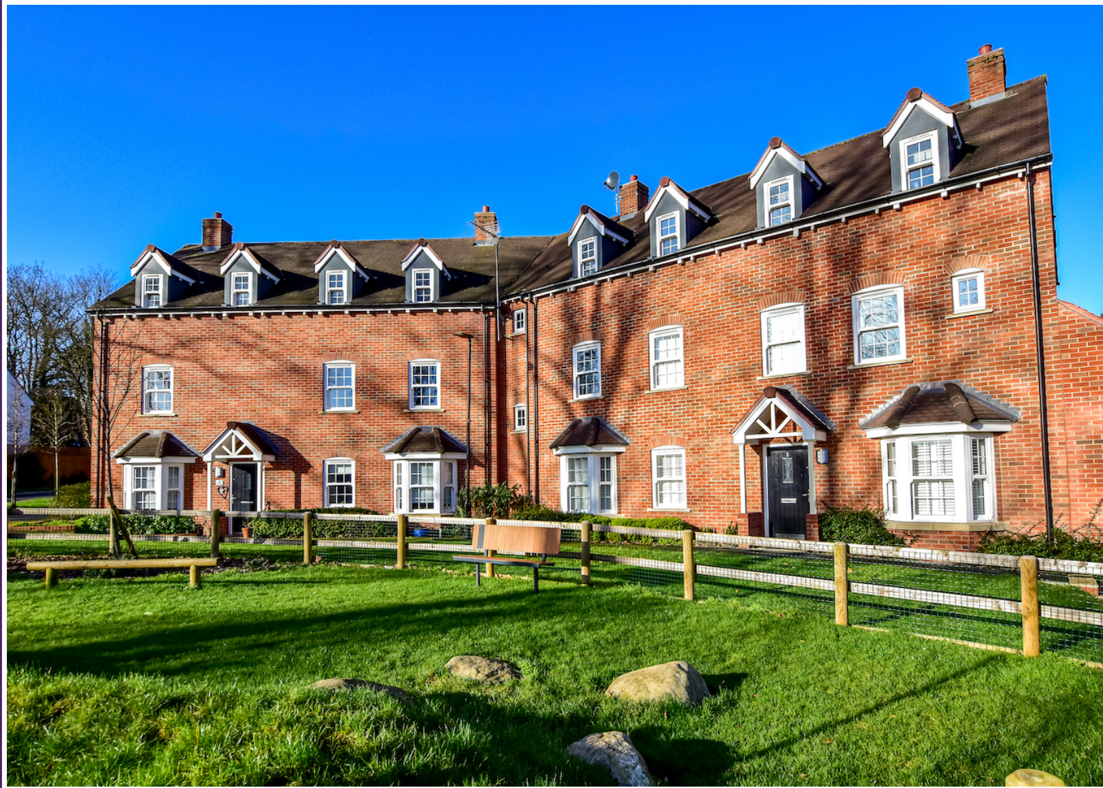
Quaker Court, Grange Road, Chalfont St Peter, Buckinghamshire. SL9 9FJ.