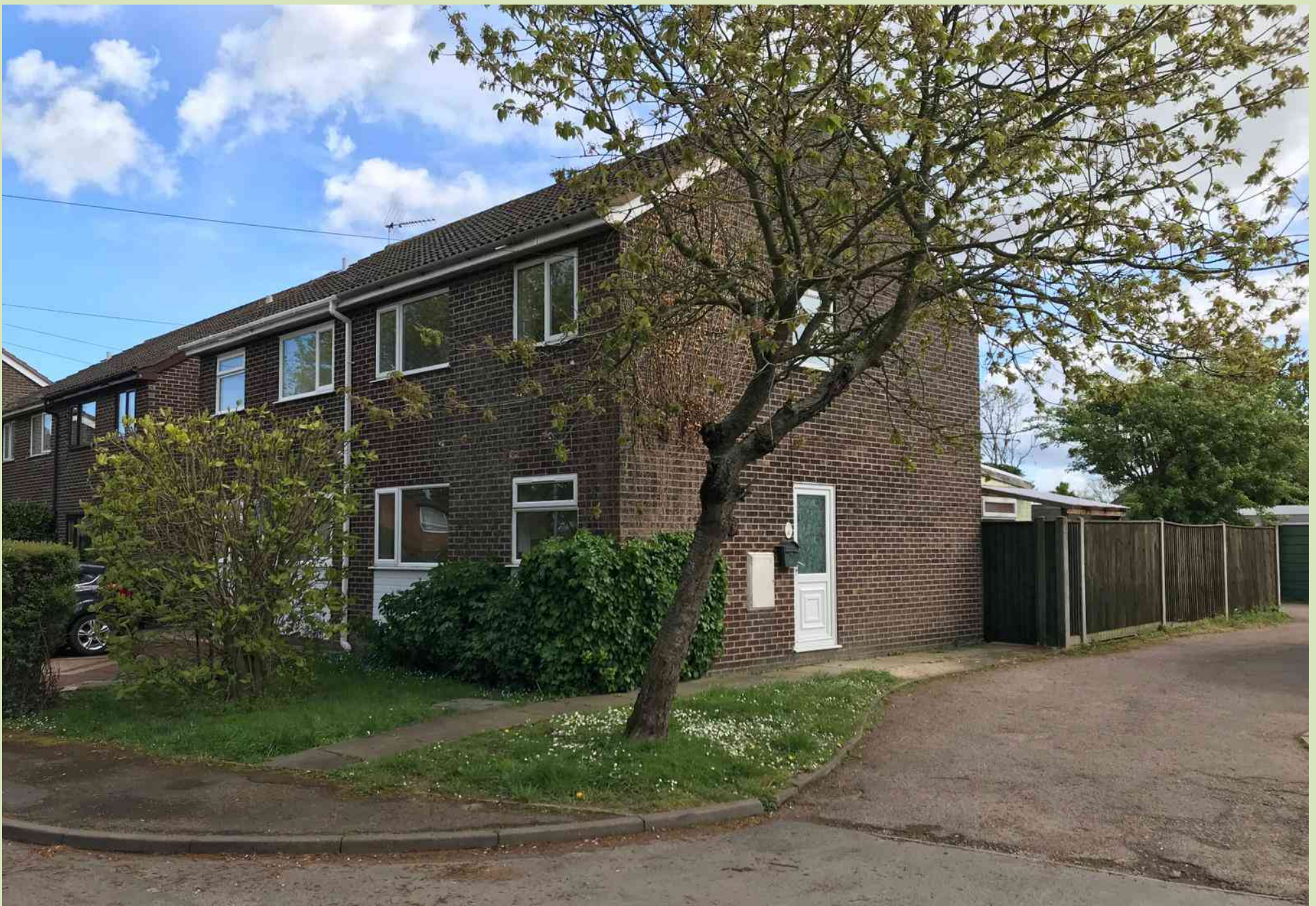
11 Wodehouse Close, Stalham Guide Price £160,000