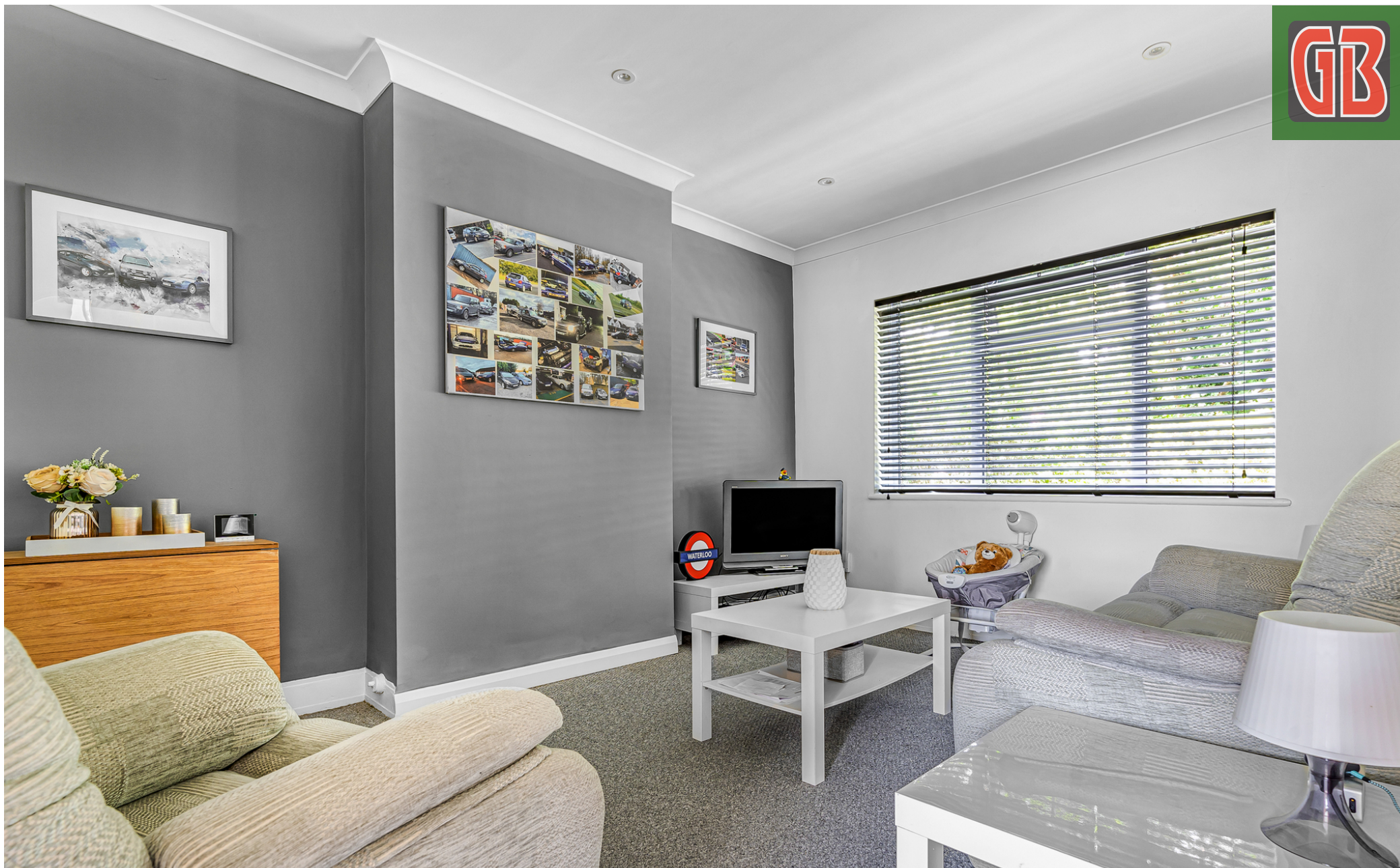
7 Pelham Court, Kingston Road, Staines-upon-Thames, Surrey. TW18 1AL. 1 Bedroom Apartment - £250,000 Leasehold