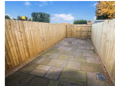
5 Denny Cottages Church Street, Langford, Bedfordshire, SG18 9QT