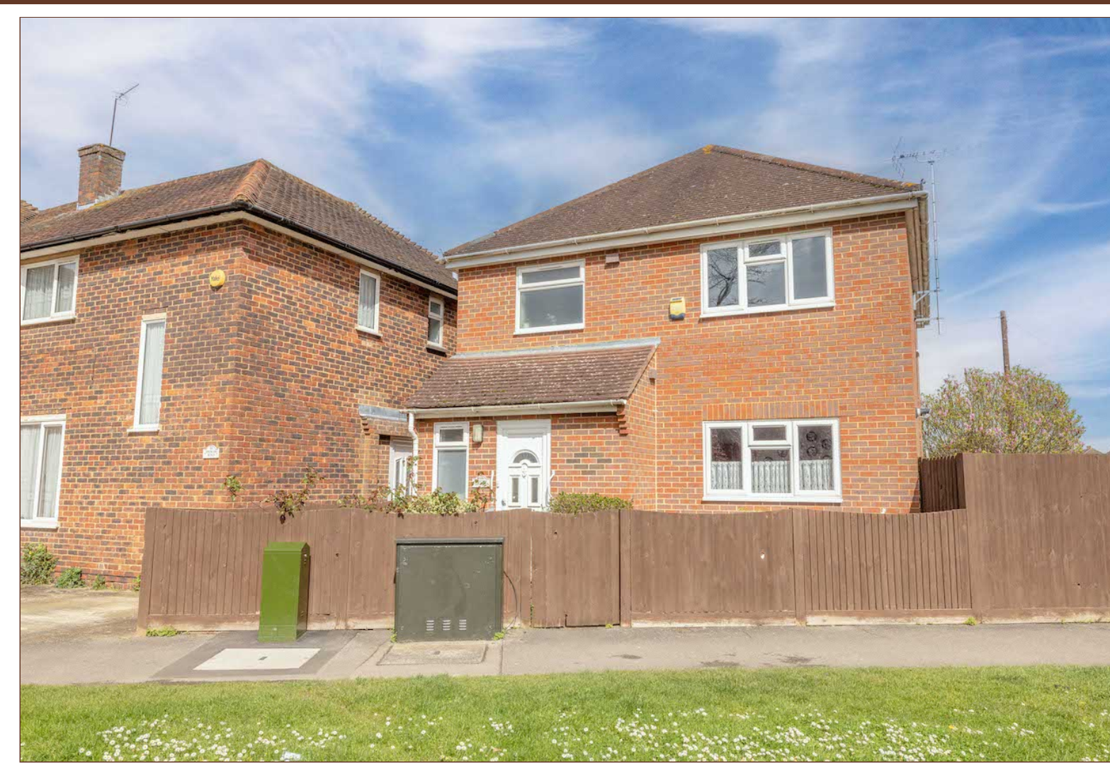
Situated in a prime location within walking distance of multiple nearby primary schools, as well as Langley Grammar School, this three bedroom detached property is offered to the market with no onward chain, inviting a quick sale.

The ground floor features spacious entrance hallway with access to a downstairs cloakroom and leading to fitted kitchen. The main reception room lies across the back of the house overlooking the rear garden, and stretches 20ft with ample space for both living and dining furniture.