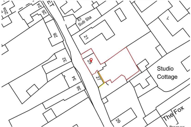
Yellow indicates right of way/access to garden

To discuss this unique home or one you wish to sell, please contact us.