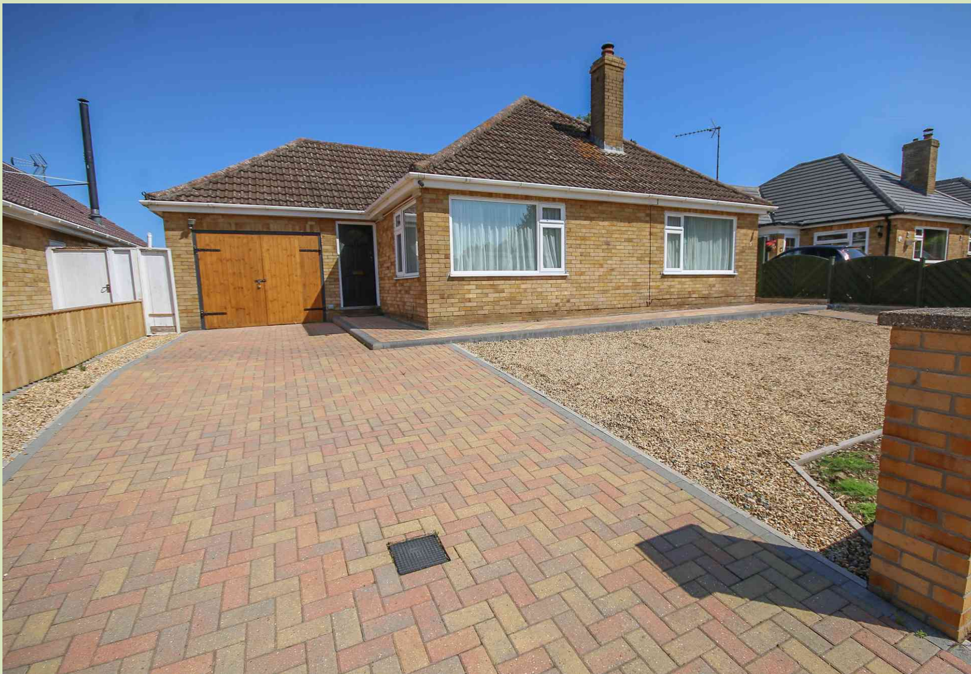
5 Watering Lane, West Winch Guide Price £279,950