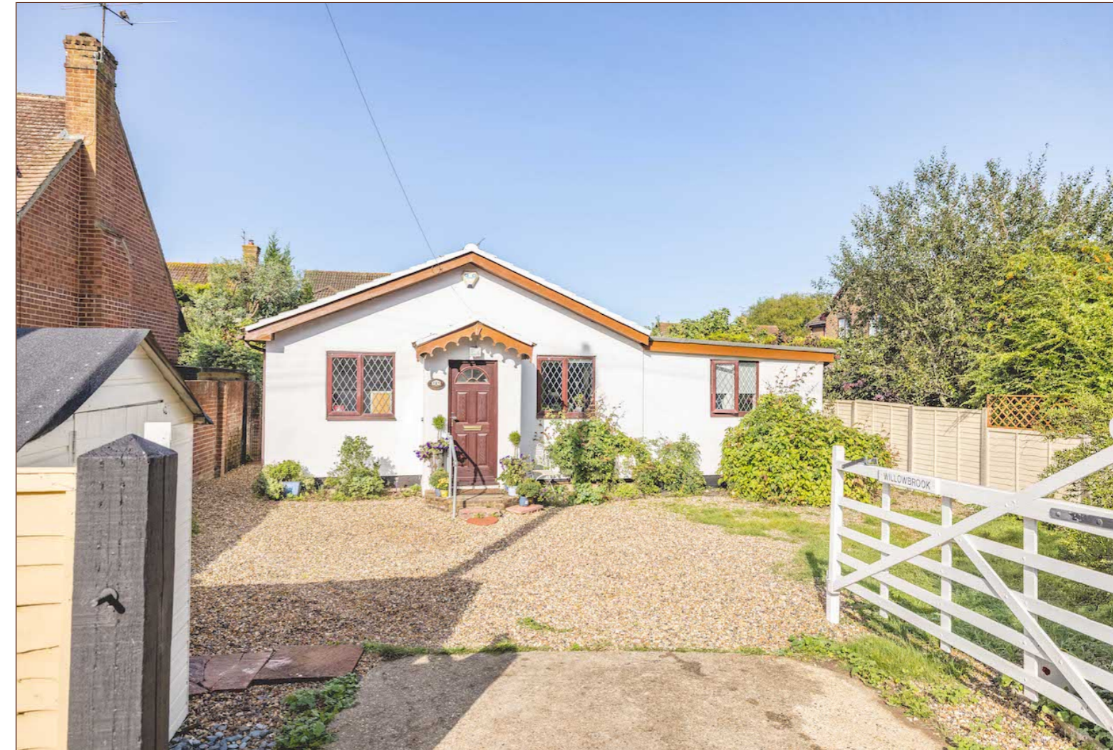
This two bedroom detached bungalow is tucked away in a popular cul-de-sac location.

To the front of the property there is parking for 3-4 cars. Inside, the hallway leads to one of the double bedrooms and the front reception room, from there you have a spacious kitchen and utility leading onto the sunny and private courtyard. There is a further reception room leading to a conservatory and another great sized double bedroom.