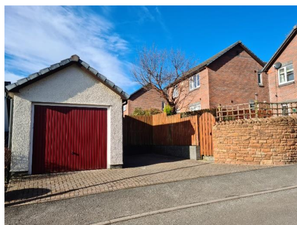
DRIVEWAY AND GARAGE

DIRECTIONS – From Appleby town centre cross the river Eden via Bridge Street and turn right at The Sands. Following the road up through The Narrows, take the next turning left signposted Murton and Hilton. At the mini roundabout immediately after the railway bridge take the left fork and then turn left into Rivington Park.