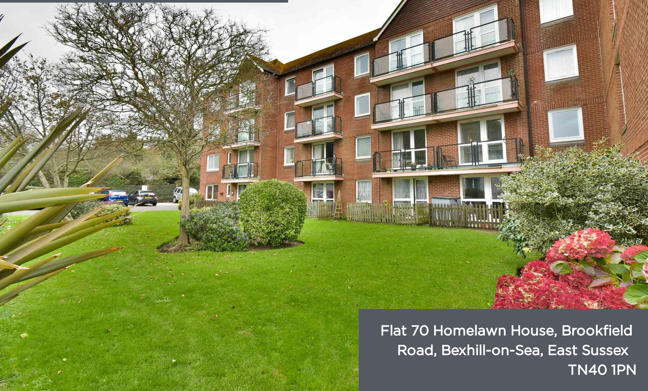
Flat 70 Homelawn House, Brookfield Road, Bexhill-on-Sea, East Sussex TN40 1PN