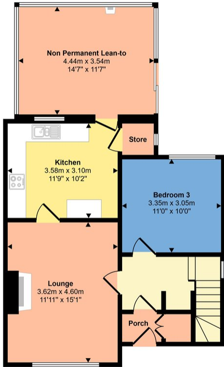
Ground Floor Approx 68 sq m / 729 sq ft

Approx Gross Internal Area 110 sq m / 1185 sq ft