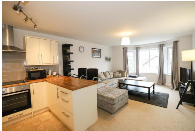
OPEN PLAN LIVING/DINING/KITCHEN