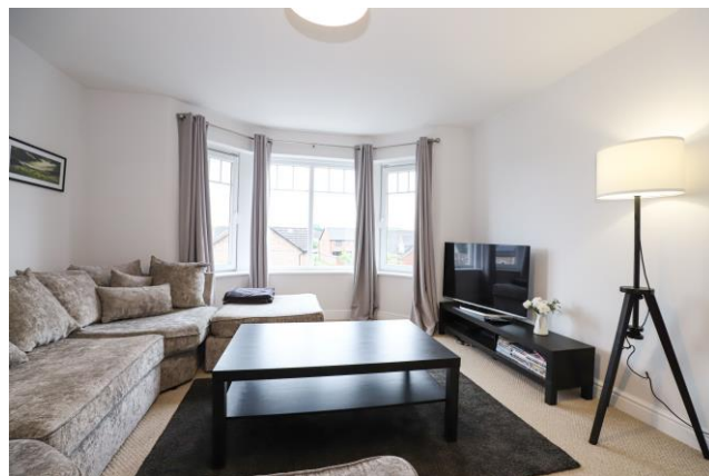
OPEN PLAN LIVING/DINING/KITCHEN

BEDROOM 1 (13'7 x 11'5) Double glazed window to the front and radiator.