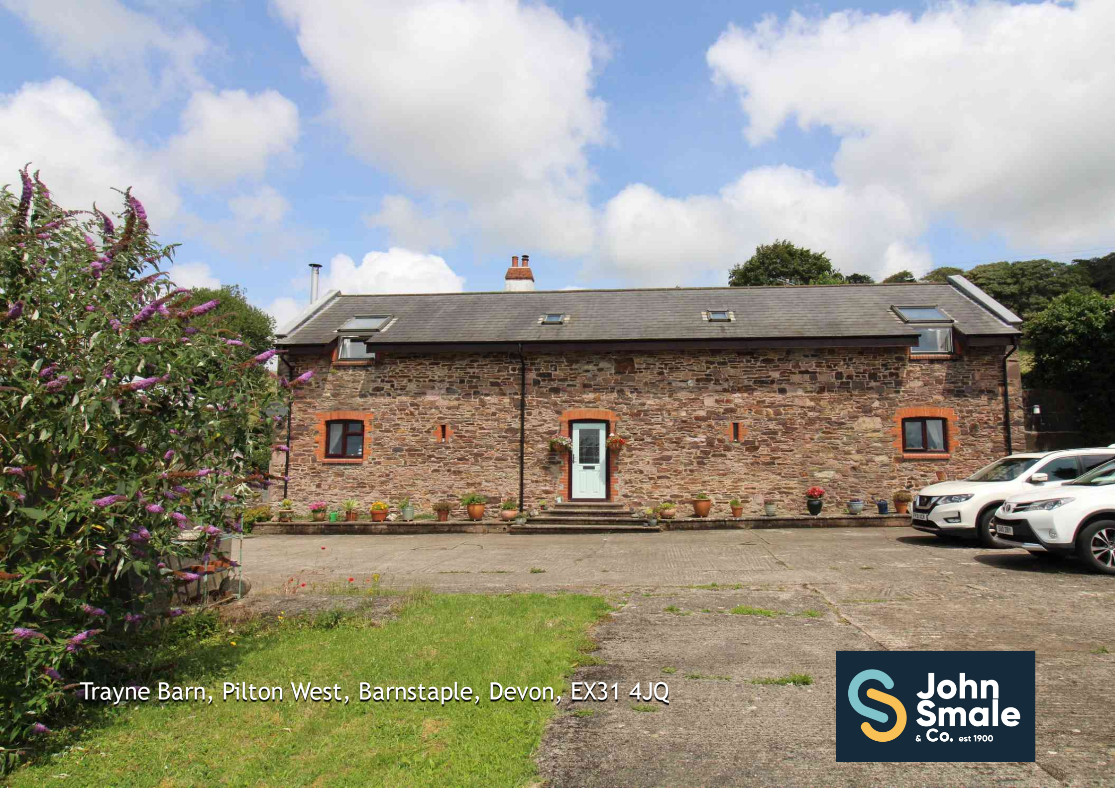
Trayne Barn, Pilton West, Barnstaple, Devon, EX31 4JQ