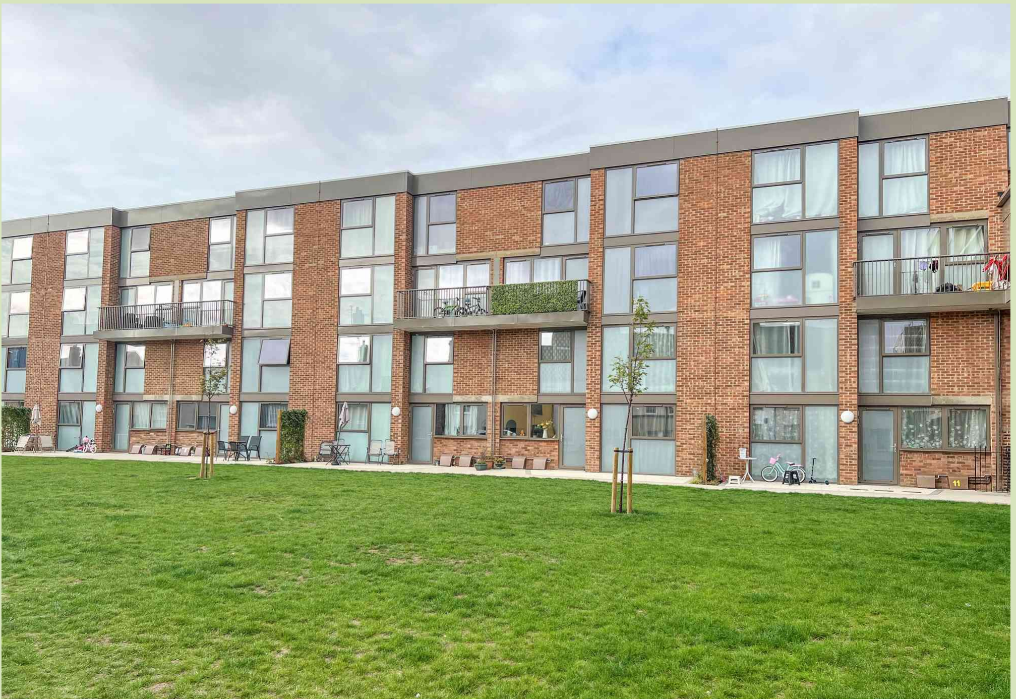
10 Farrow Court, King's Lynn Guide Price £139,950