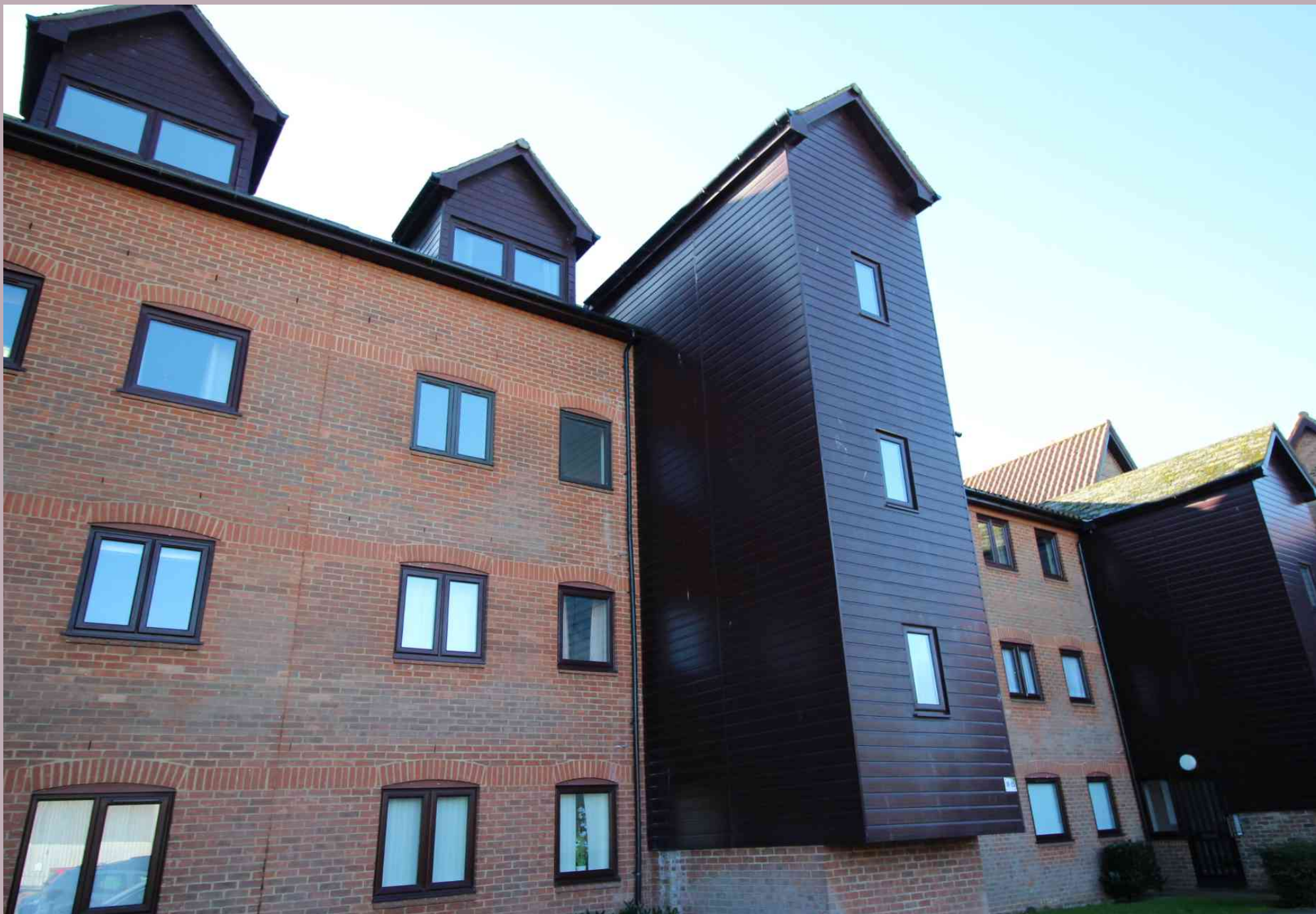
Trinity Quay, King's Lynn £850 per calendar month