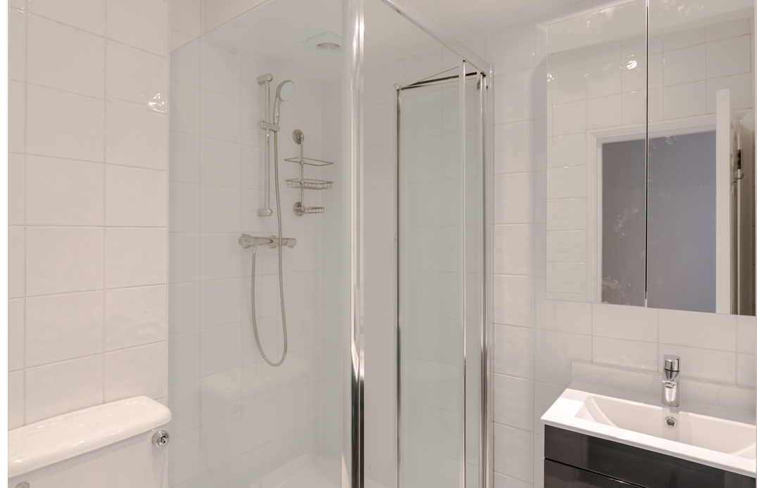
Flat 6 53 York Street, London, W1H 1PU £1,250 p/w