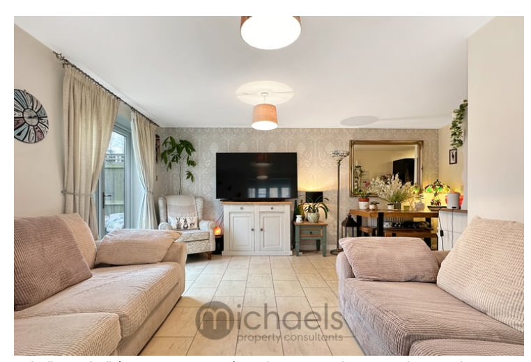
18' 3" \times 15' 1" (5.56m \times 4.60m) With Bay window to side, window to rear, French doors to garden, tiled floor, radiator.