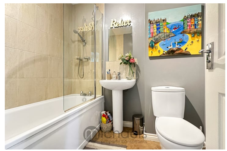
With tiled floor, wash hand basin, close coupled WC, panelled bath with shower attachment and part tiled walls.