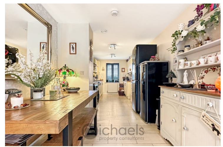
12' 9" x 8' 3" (3.89m x 2.51m) With window to front, tiled flooring, a range of matching eye level and base units with drawers and worktops over, inset sink and drainer, electric oven and gas hob, space for dishwasher and washing machine, space for fridge/freezer, open to;