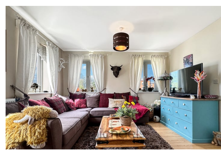
15'\,1'' \times 12'\,1'' (4.60m x 3.68m) With two windows to front and side, radiator, TV point.