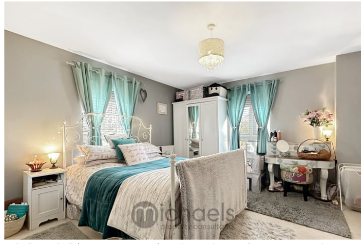
15' \, 1'' \, x \, 12' \, 1'' \, (4.60 \, m \, x \, 3.68 \, m) With window to front, two windows to side, radiator.