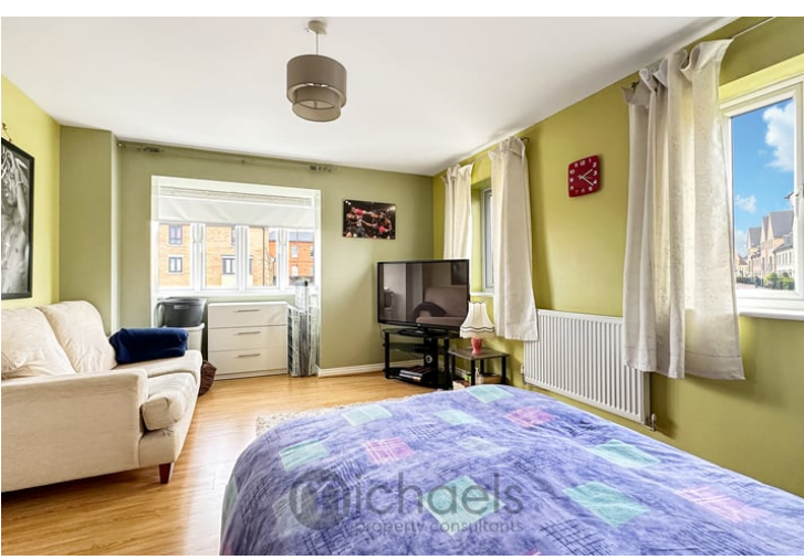
17'9" \times 11'5" (5.41m x 3.48m) With bay window to side, two windows to rear, radiator.