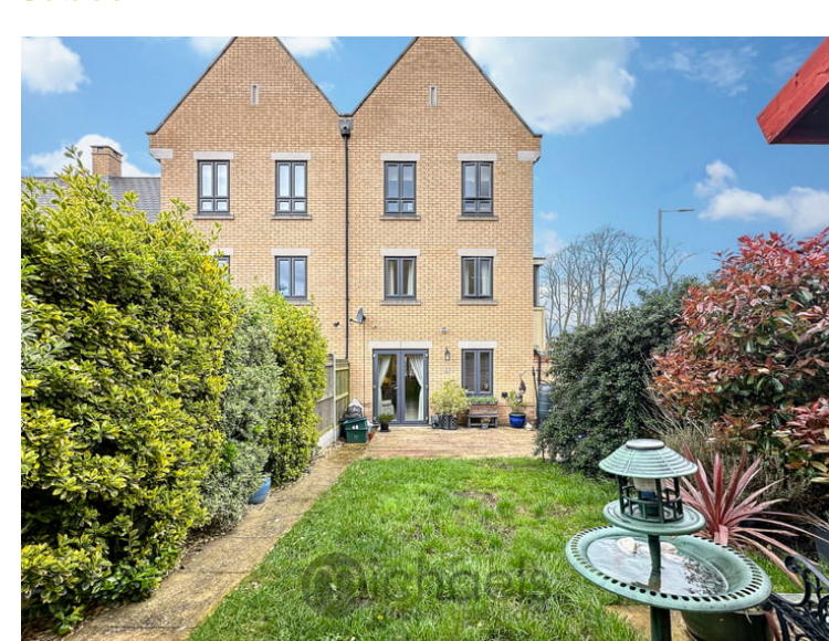
The property benefits from a good sized rear garden that is enclosed by panelled fencing and brick walling with gated rear access. The garden offers a great space for outdoor dining and entertaining. Further to the rear the property offers parking and a garage.