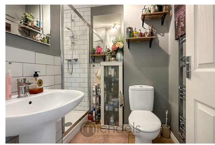
With radiator, wash hand basin, close coupled WC, shower cubicle.