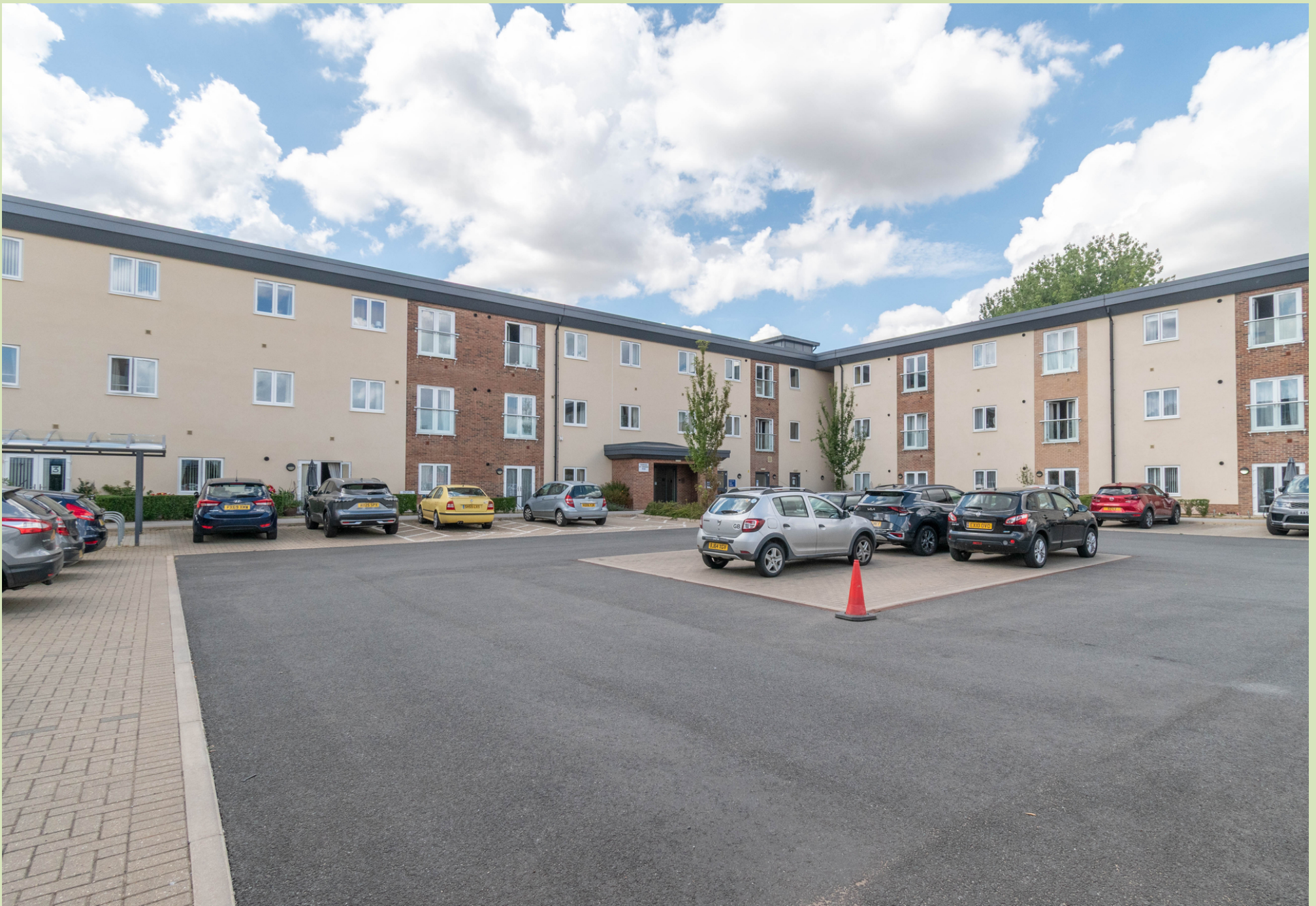
23 Meadow Walk Trinity Road, Fakenham Guide Price £180,000