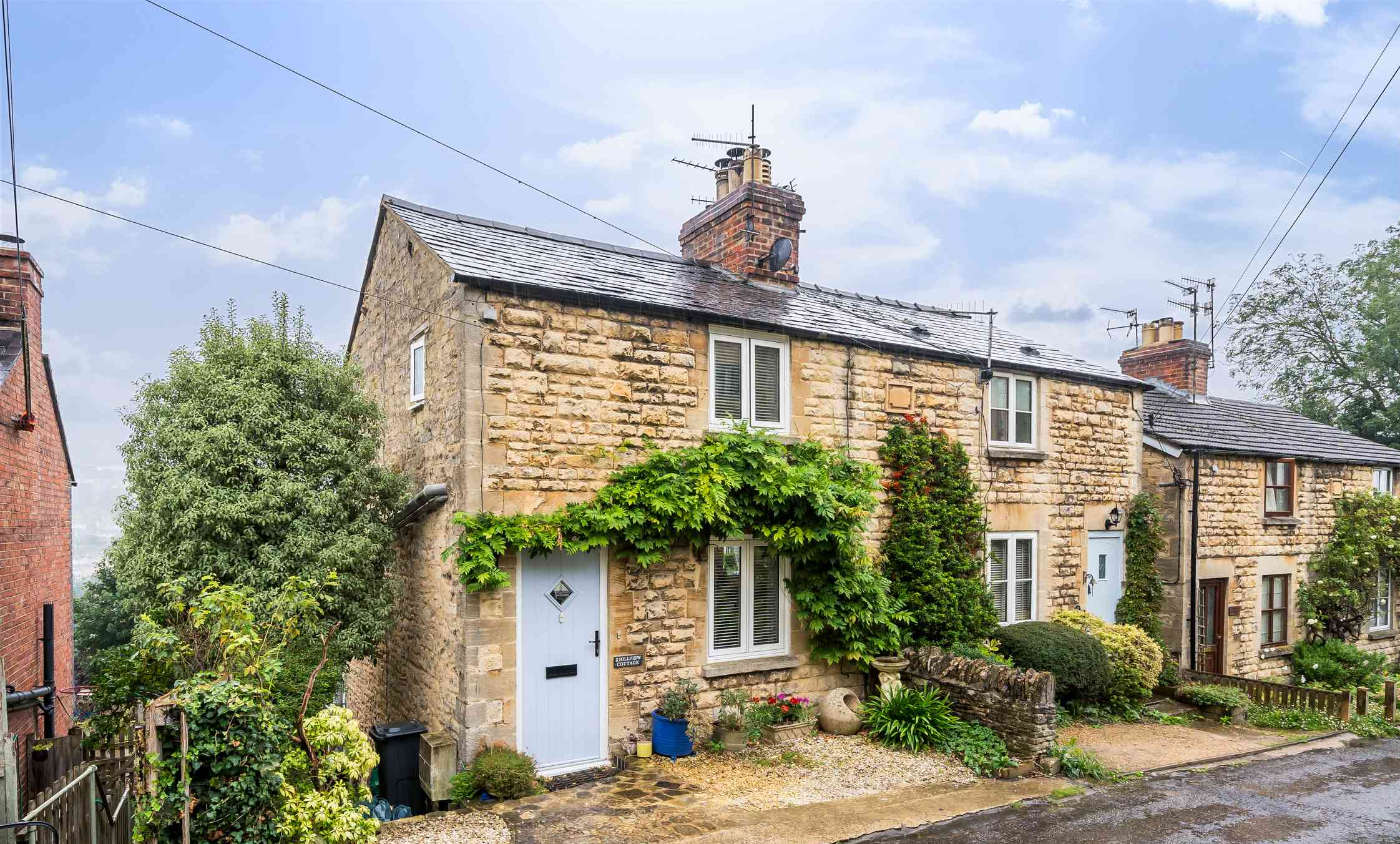
2 Hillview Cottage, Rodborough Lane, Stroud, Gloucestershire, GL5 2LJ Guide Price £370,000