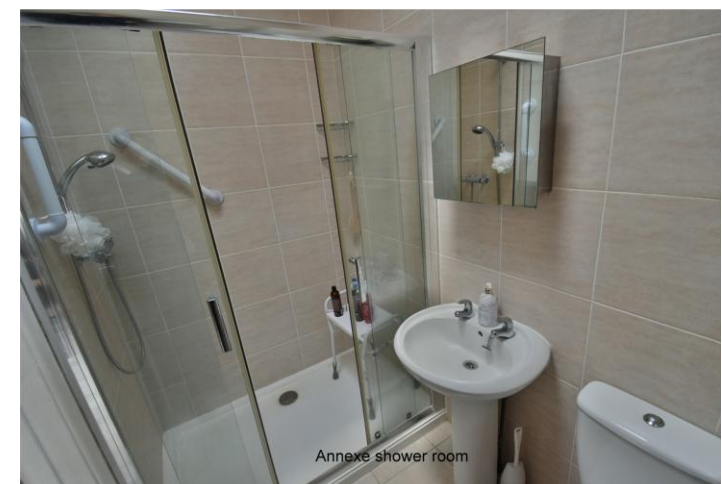
Annexe shower room