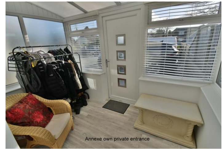
Annexe own private entrance