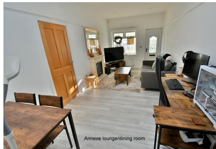
Annexe lounge/dining room