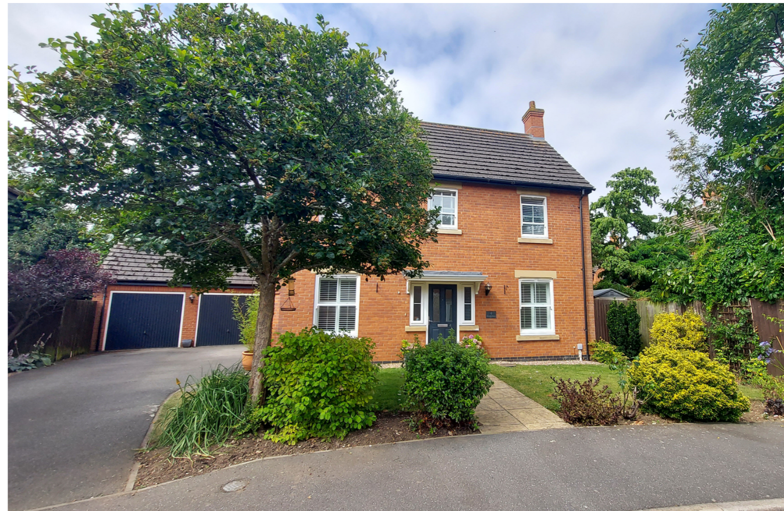
4 Windle Drive, Bourne, Lincolnshire PE10 0DB