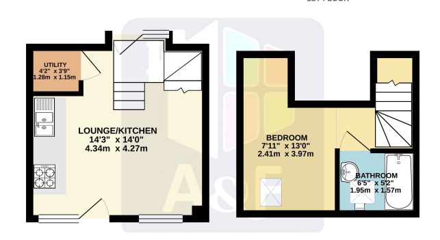
Whist every attempt has been made to ensure the accuracy of the thoughter contained here, measurem of dones, wisdows, concess and any other tense are approximate and no respeciablity is taken to any rem omission or mis-statement. This plan is for illustrative purposes only and should be used as such by an prospective purchaser. The network, systems and applicances shown have not be neithed and no guarartees to their openability or efficiency, can be given.