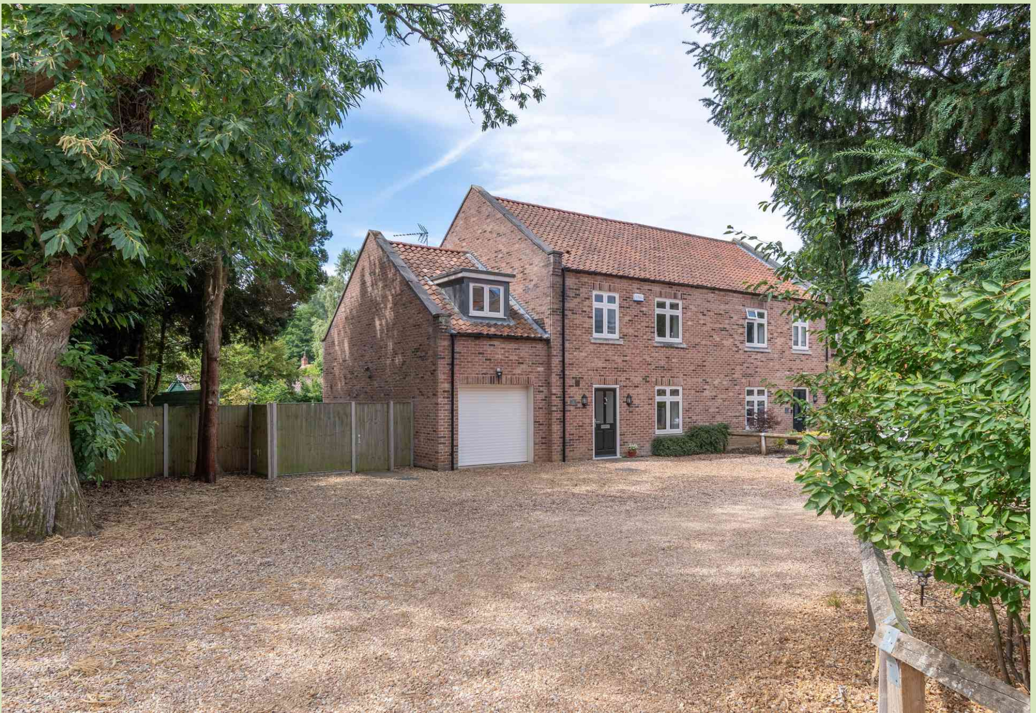
3 Chestnut Close, Fakenham Guide Price £450,000