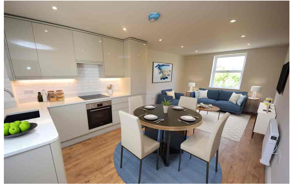
6 The Old Elephant & Castle, Causeway, Banbury, Oxfordshire. OX16 4SN Guide Price £247,000 - Share of Freehold