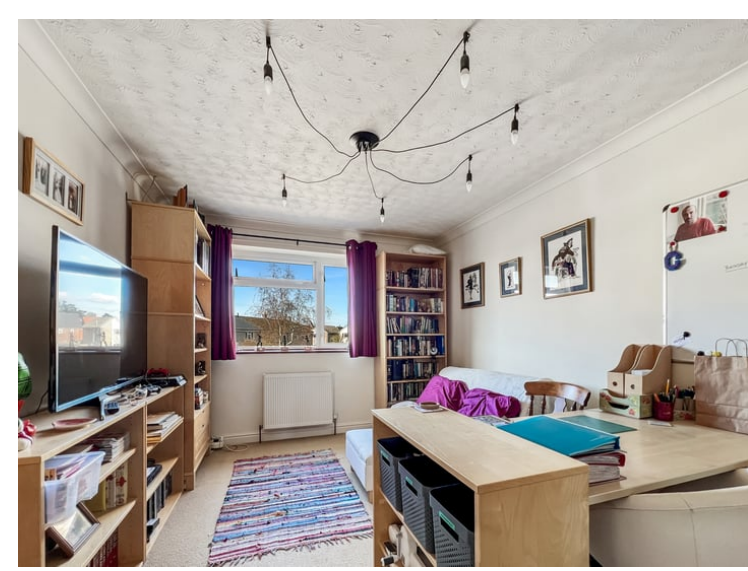
4.66m x 3.16m (15' 3" x 10' 4")