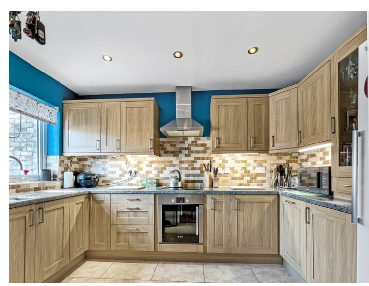
3.67m x 2.38m (12' 0" x 7' 10")