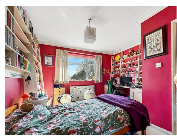
3.72m x 3.42m (12' 2" x 11' 3")