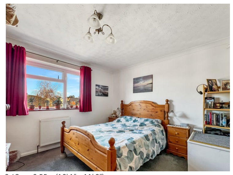
3.69m x 3.55m (12' 1" x 11' 8")