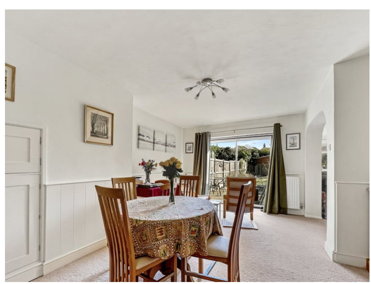
5.23m x 4.27m (17' 2" x 14' 0")