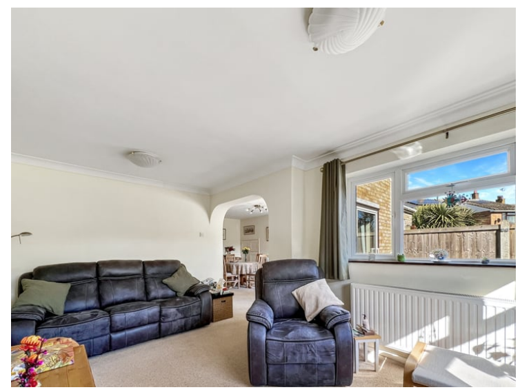
5.23m x 3.16m (17' 2" x 10' 4")