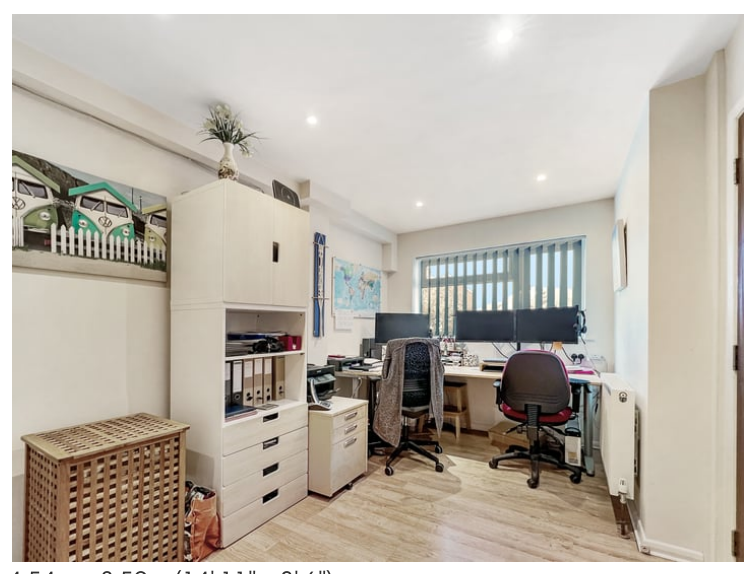
4.54m x 2.59m (14' 11" x 8' 6")