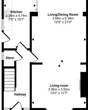
Ground Floor Approx 56 sq m / 600 sq ft

First Floor Approx 42 sq m / 452 sq ft Whilst every attempt has been made to ensure the accuracy of the floor plan contained here, measurements of doors, windows, rooms and any other items are approximate and no responsibility is taken for any error, omission, or mis-statement. The measurements should not be relied upon for valuation, transaction and/or funding purposes. This plan is for literative purposes only and should be used as such by any prospective purchaser or tenant.