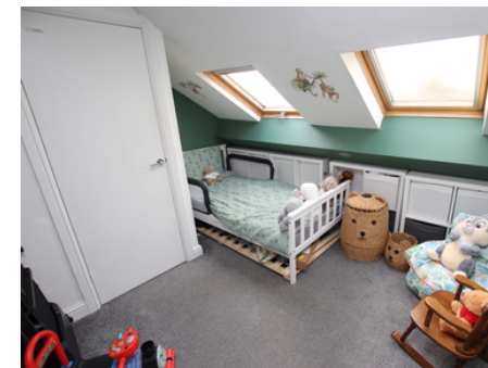
131 Church Street, Langford, Biggleswade, Bedfordshire, SG18 9NX